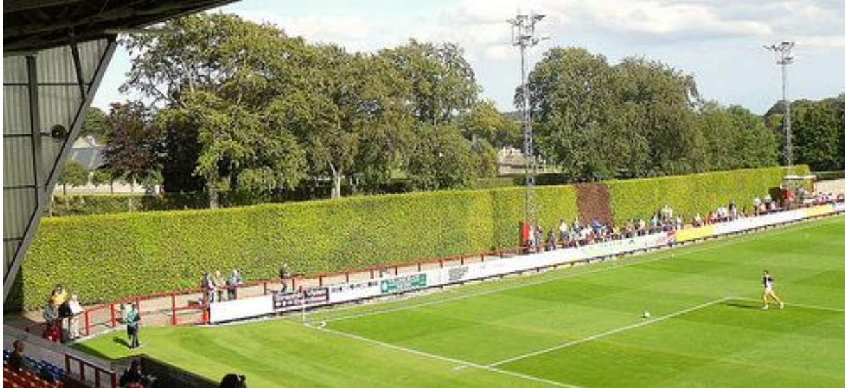
The Hedge End

The Main Stand is a small all seated covered stand, which straddles the half way line with a capacity of 290 and was built in 1981 to make the ground wider by two yards and replaced a similar looking wooden stand.