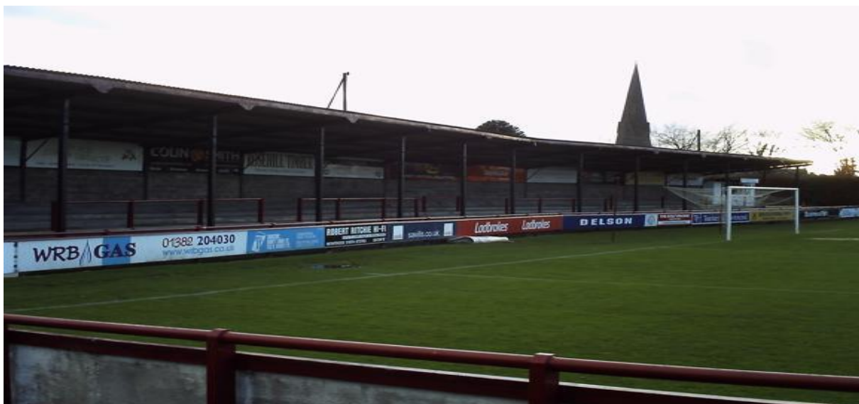
Cemetery End (Brechin City)